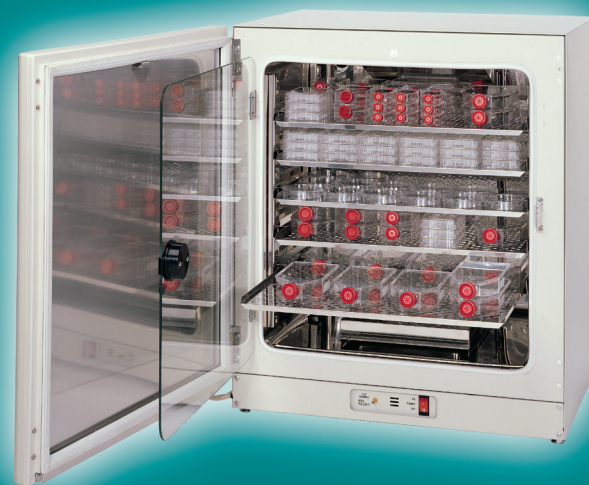
SANYO Model MCO-20AIC with SafeCell UV germicidal protection, InCuSaFe™ copper-enriched stainless steel interior and ceramic IR precision infrared CO 2 system.

Learn more. Go to www.sanyo.co.jp/biomedical